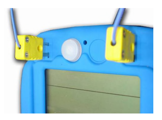
Connecting temperature probes

Connect them in the special spaces (check the thermocouples polarity), wait a few seconds for the correct temperature value to appear on the display. The absence of connection of the thermocouples is indicated on the display by the symbol "- - -".